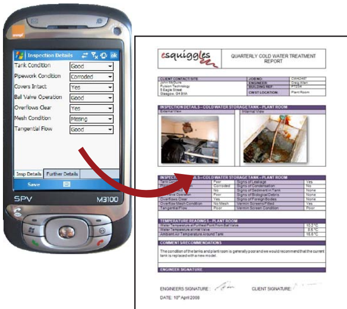
Figure 1: Convert data on hand-held PC to a final report automatically

As part of standard contracts with mobile phone providers, hand-held PCs which are capable of running eSquiggles, are low cost and often free! This makes the cost of using mobile working technology more cost effective, with minimal hardware costs. Our Consultants can advise on the best hand-held devices to use and how to obtain them.